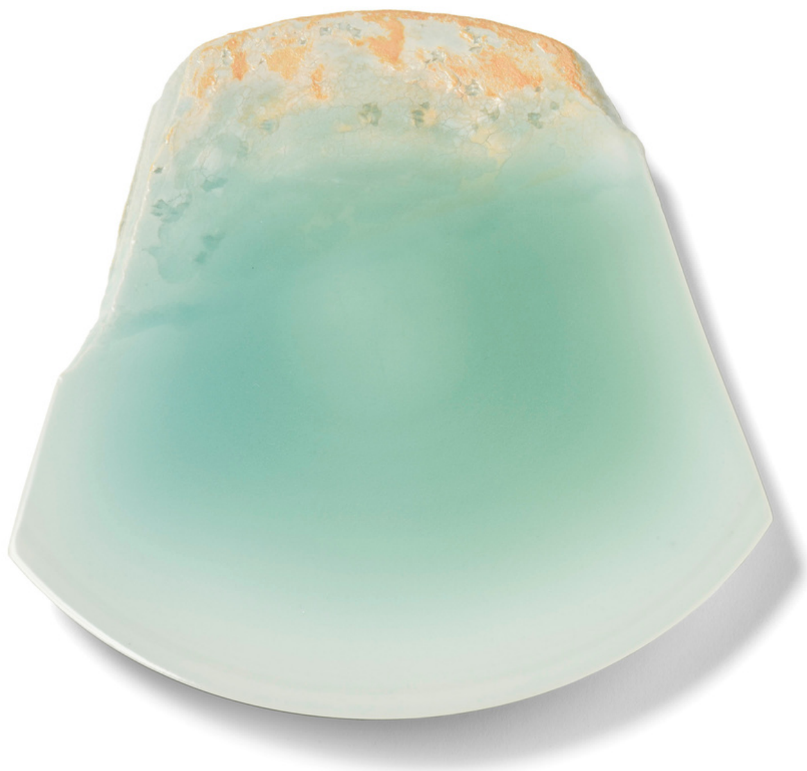
© Satoshi Kino Evening Tide Glazed porcelain 2021