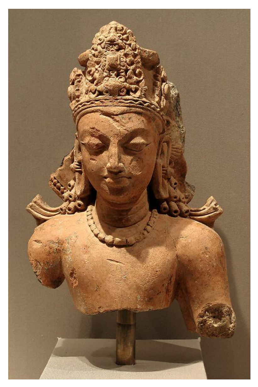
Metropolitan Museum bust, Ve-Vlème century, India (Bengale) or Bangladesh, Terracotta.

IX. Comparable artwork – The Metropolitan museum of art, New-York