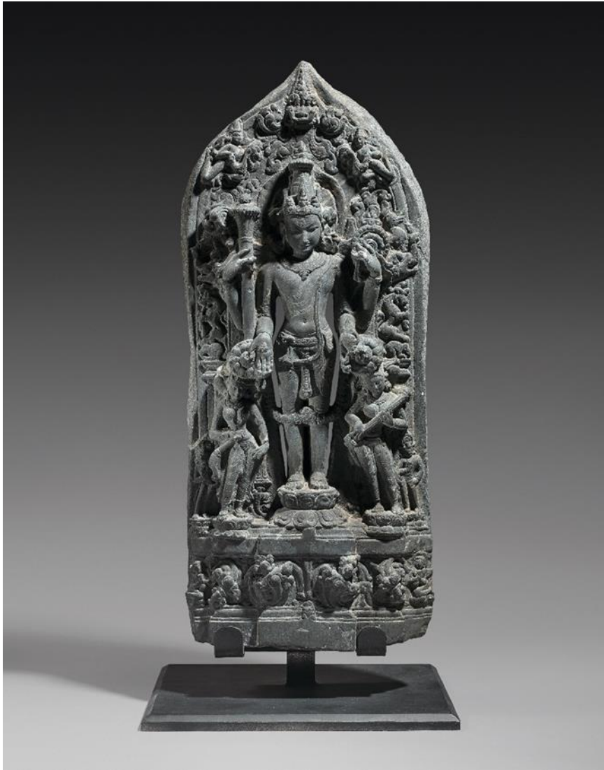
Pala Stele depicting Visnu (P531)