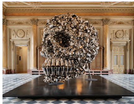
Very Hungry God (2006), Pinault Collection View of the exhibition of Subodh Gupta, Adda / Rendez-vous, Monnaie de Paris, 2018

Subodh Gupta's residency at the Monnaie de Paris resulted in the creation of two new mints, as well as in an exhibition inaugurating the renovated facility of the museum including the space at Quai Conti. With 30 works on view, this marks the artist's first museum retrospective in France. Subodh Gupta (b 1964 in India) conceived the exhibition around adda , the Indian concept in Hindi for exchanges, discussions and debates. Originally trained as a painter, the artist has drifted towards installations, video and sculptures with his use of stainless steel items, bicycles or buckets commonly used in India having become his hallmark. Gupta has made it a point to address various topics of importance to him like migration, the making and sharing of food or the cosmos. The exhibition covers a broad timespan of the artist's oeuvre providing an