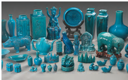
A selection of Chinese turquoise wares, 18th century, estimates vary, Aguttes