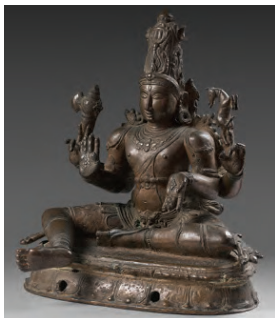
Sukhasana Shiva, bronze, height 35.5 cm, 14/15th century, Southern India, Renaud Montméat

• Galerie Indian Heritage , 21 rue Guénégaud, Paris, indianheritage.biz