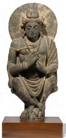
Figure of a bodhisattva, Gandhara, grey schist, 2nd/3rd century, est Euro 15/20,000, Artcurial