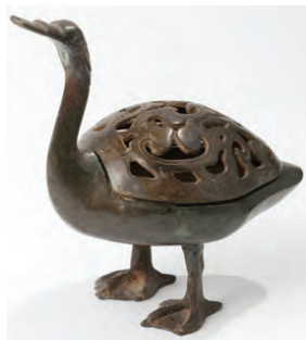
Incense burner in form of duck, Bronze, Western Han (206 BC AD 9), Musée Cernuschi