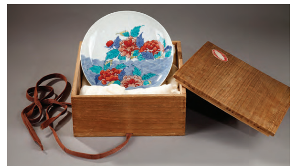
Nabeshima saucer dish, Edo period, late 17th/early 18th century, Galerie Théorème