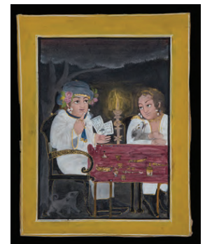
Two European women, pigments and gold on paper, India, Rajasthan, Bundi, second half of the 18th century, 22 x 17 cm, Alexis Renard

• Galerie Théorème , 15 rue de Lille, Paris, galerie-theoreme.com