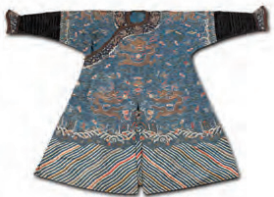
Dragon robe (longbao), 19th century, China, est Euro 12/15,000, Aguttes