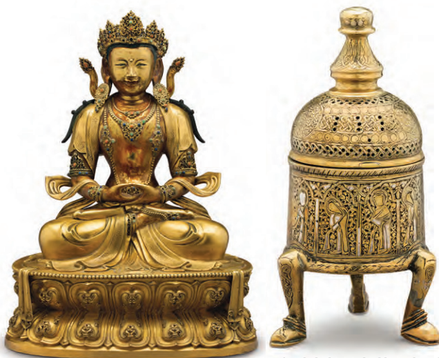
Imperial gilt-bronze figure of Amitayus, China, Kangxi period (1662-1722), height 419 cm, sold for $2,532,500 (est $400/600,000), 10 June

In Asian art, world records in the Travel and Americana sale included an imperial gilt-bronze figure of Amitayus which sold for $2,532,500, setting a record for a Kangxi gilt-bronze; a large Chinese export 'tobacco leaf' assembled dinner service, Qianlong period, circa 1775, that fetched $1,152,500 (est $200/300,000), setting a record for a dinner service; and for Portrait of the Artist Reza 'Abbasi by Mu'in Musavvir, Isfahan, signed and dated