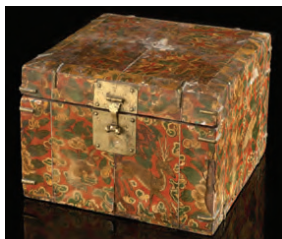
Casket, wood, leather and lacquer, Korea, Joseon dynasty, 19th century, est Euro 5/7000, Artcurial