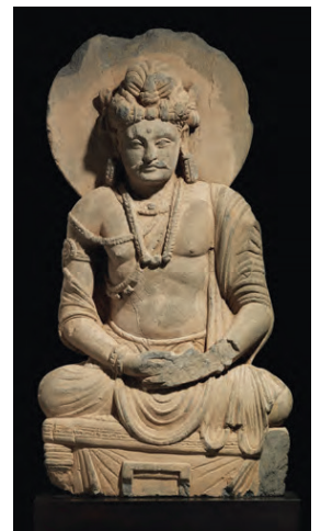
Bodhisattva meditating, schist, Ancient province of Ganbara (Northern Pakistan), 2nd/3rd century, height: 58 cm, Galerie Christophe Hioco