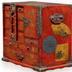
Kodansu-suzuribako, Edo period, 18th century, 37.5 x 39.5 x 24 cm, hiramakie, takamakie and nashiji lacquer techniques, Galerie Mingei