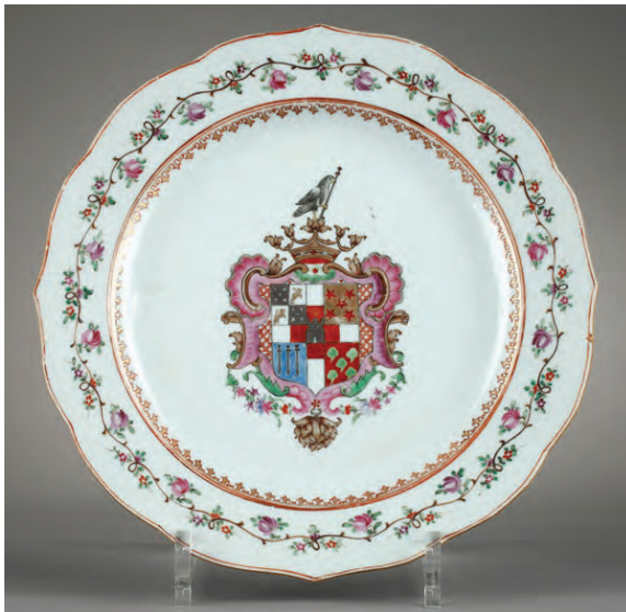
Famille-verte dish with the French royal coat-of-arms, circa 1710–1715, earlier than the royal order of Louis XVth (1725), Galerie Bertrand de Lavergne

bronzes and thangkas , including a Hayagriva gilded bronze figure from Northern China, as well as a selection of Buddhist pieces from Thailand and Sri Lanka. Christophe Hioco is exhibiting at Compagnie de la Chine et des Indes's gallery for this event – their second collaboration, having already celebrated the 80th anniversary of the Compagnie (who are also participating in Printemps Asiatique in the gallery).