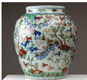
Wucai 'hundred deer' vase, Wanli period, mark and period, China, est Euro 20/30,000, Cornette de Saint Cyr