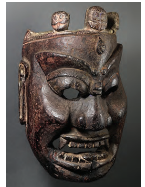
Buddhist mask of a wrathful deity, 30cm, Northern Nepal, Galerie Indian Heritage

Galerie Christophe Hioco specialises in Indian and Himalayan art, as well as Southeast Asian bronzes. There are more than 40 pieces in this exhibition, including a selection of Gandharan works of art (a highlight is a seated bodhisattva). Also on show are Tibetan