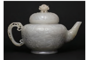
White jade, carved Mughal-style teapot and cover decorated with female immortals overlapping mythical animals, China, Qing period, 18/19th century, height 16 cm, Gauchet Asian Art

Jean Gauchet is offering a selection of Buddhist figures and scholars' objects. Highlights include a pair of Tang-dynasty gilt-bronze Bodhisattva and a gilt-bronze Lokapala's head from the Densatil Monastery in Tibet. Also on offer are category of objects made from materials such as stone, bronze, and wood that show an aesthetic and a technical mastery that made these objects highly sought after by scholars, courtiers and emperor. A highlight of the exhibition is a carved white jade teapot, dating to the Qing dynasty.