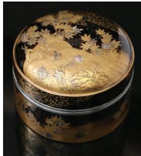
Kobako box (incense container), black and gold lacquer. Japan 19th century, 5.5 x 7 cm, Ateliers Brugier

June sees the first edition of this new initiative to promote Asian art in Europe – especially in Paris. The new event, building on the success of Asia Week New York and Asian Art in London, aims to attract established and new collectors, galleries and auction houses to come together to promote Asian art in all its forms. Twenty galleries and five auctions houses are committed to the first event, along with smaller auction houses and associates that offer their sales through Hôtel Drouot. The two major Asian museums in Paris have also joined the initiative, Musée Cernuschi and Musée Guimet. A brochure, including a map, can be found in the participating galleries. Many galleries are having an Open House on 7 June evening – please check with individual galleries for openings and specific times.