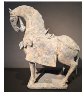
Caparisoned horse, Northern Wei dynasty (386–534), China, Galerie Eric Pouillet

red lacquer lanterns in a woodland. In various parts of Japan, the foxes wedding folklore is recounted in literature and re-enacted, or performed, at rituals and festivals. Foxes are popular creatures in Japan, being seen as intelligent shape-shifters and tricksters, who possess magical powers and are regarded as spiritual entities (they are associated with Inari the Shinto deity for rice).