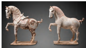
Pair of horses, Tang dynasty (618-907), traces of red and gold polychrome, Galerie Jacques Barrère