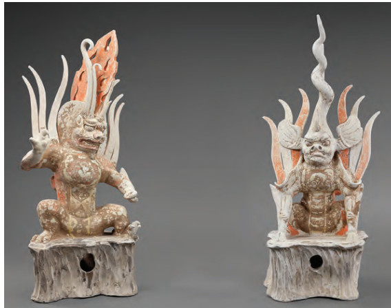
Earthenware earth spirits, China, Tang dynasty (618-907) heights: 63.2 cm and 59.8 cm, Galerie Christian Deydier