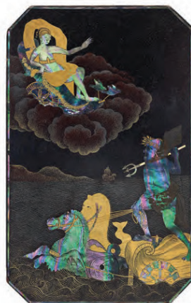
Copper and black Nagasaki lacquer box inspired by a European engraving, mid Edo period, Japan, 14 x 8.7 cm, Espace 4

• Galerie Anne Duchange, 21 Quai Voltaire, Paris