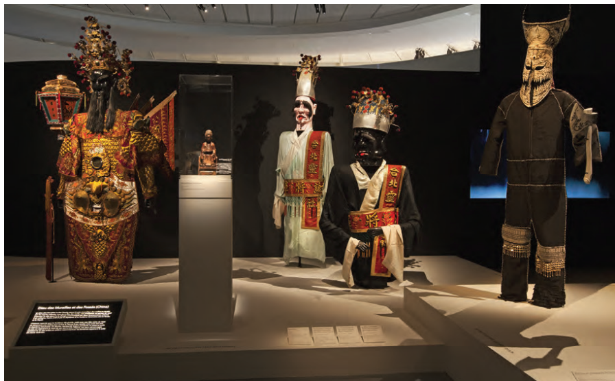
Installation view of Ghosts and Hells at Musée du Quai Branly, Paris