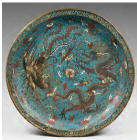
Cloisonné enamel 'dragon and phoenix' charger, China, Ming dynasty, late 16th century diam. 42.5 cm, Antiquités Valerie Levesque