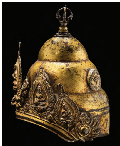
Buddhist crown, copper gilt, decorated with the principal five Buddhas of the supreme pentacle, Nepal, 18th century, height 24 cm, Juliette Moreau-Gobard

For Printemps Asiatique, the gallery is offering a selection of East Asian art, including a selection of recently acquired Chinese export paintings and a selection of Japanese inro . From the Japanese selection, a highlight is a four-case inro by Shunposai Setsuzan from the late Edo period, circa 1800. The inro is decorated with a scene from the Japanese tale kitsune no yomeiri , showing the wedding procession of foxes holding