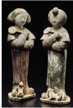
Pair of figures China, Tang period (618-907) Artcade Gallery