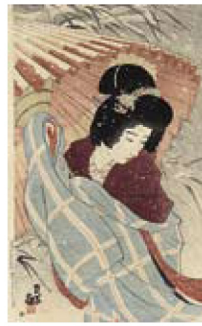
'Gendai bijinshū dai-nishū – Fubuki' (Snowstorm), no. 33 of an edition of 250 By Ito Shinsui (1898-1972), 1932 Galerie Tanakaya