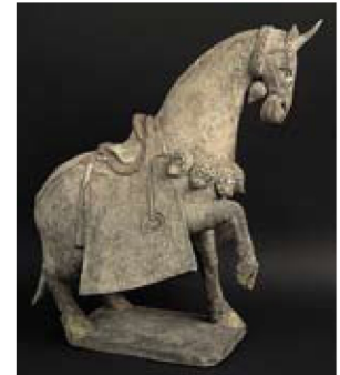
Horse China, Northern Wei period (386-534) Eric Pouillot

fifth time. New pieces and highlights include a Northern Wei period earthenware horse with traces of polychrome pigment, its front right leg raised (H. 27 cm), and a kneeling dancer from an imperial tomb dating from the beginning of the Western Han period.